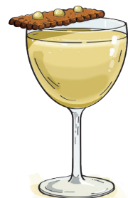
~ Lemon Cheesecake

Appleton 12yr & Diplomatico Planas, Orange Creole shrubb & Velvet Falernum; accompanied by lime, mint, passionfruit, almond & a rich demerara finish. One to set your eyes alight.